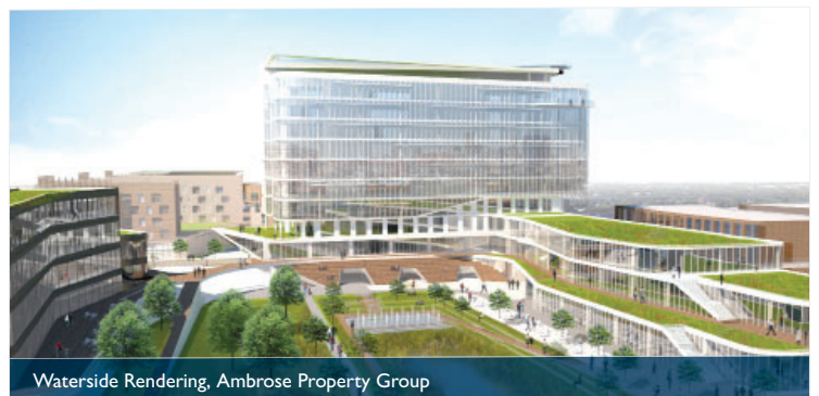
Waterside Rendering, Ambrose Property Group

Two other significant large-scale projects, Bottleworks and Waterside, are generating momentum. The Bottleworks District gained a significant tenant to anchor one of its new buildings as leading venture studio, High Alpha Studio, announced plans in September that it will relocate its headquarters to the new $300 million, 12-acre urban mixed-use development underway at the former Coca-Cola Bottling Plant. On the other side of downtown, across the White River, developer Ambrose Property Group announced its total investment in the GM Stamping Plant redevelopment will total $1.4 billion, which is up from the company's original projection of $550 million when it agreed to acquire the industrial site in May 2017. Waterside is a 15 to 20-year project that will consist of 1,350 housing units, 620 hotel rooms, 2.8 million square feet of office space, and 100,000 square feet of retail. With Indianapolis amongst the top 20 list for Amazon's new HQ2, the Waterside site is set up to be in the running.