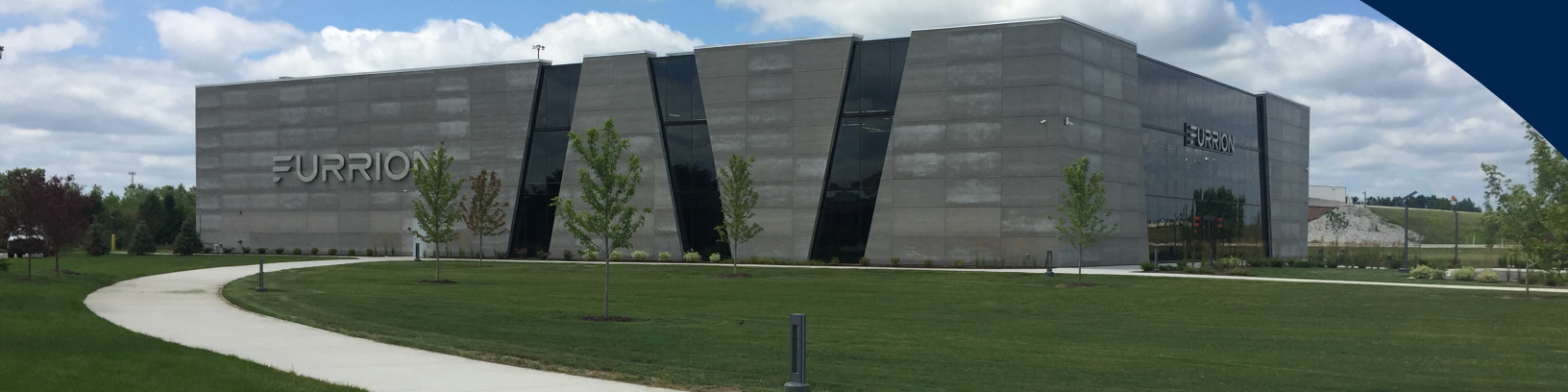
FURRION INNOVATION CENTER AND INSTITUTE OF TECHNOLOGY U.S. HEADQUARTERS, ELKHART